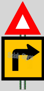
WARNING OF SHARP CURVE AHEAD