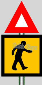
WARNING TO LOOK OUT FOR PEDESTRIANS ON THE ROAD AHEAD