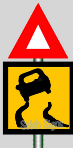
WARNING OF SLIPPERY ROAD AHEAD