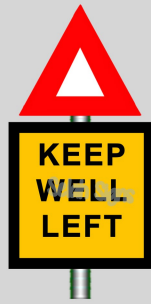
WARNING TO EMPHASIZE THAT TRAFFIC MUST KEEP WELL TO THE LEFT OF THE ROAD