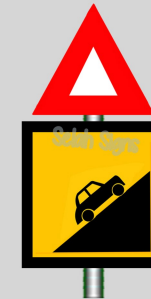
WARNING OF STEEP ASCENT AHEAD