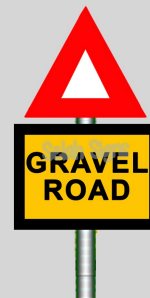
WARNING OF GRAVEL ROAD AHEAD