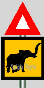
WARNING TO LOOK OUT FOR ELEPHANTS, ANTELOPES OR OTHER WILD ANIMALS ON THE ROAD