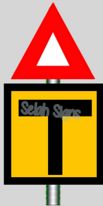
WARNING OF ROAD JUNCTION AHEAD