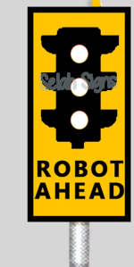
WARNING OF A ROBOT AHEAD