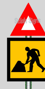
WARNING TO SLOW DOWN BECAUSE OF ROAD WORKS AHEAD