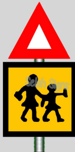
WARNING TO LOOK OUT FOR CHILDREN ON THE ROAD