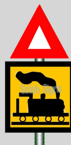
WARNING OF A RAIL/ROAD LEVEL CROSSING AHEAD