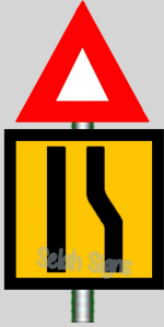
WARNING THAT ROAD NARROWS TO THE LEFT AHEAD