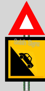
WARNING OF STEEP DESCENT AHEAD