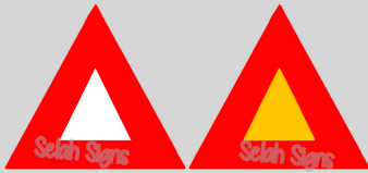
INSIGNIA OF DANGER WARNING SIGN (YELLOW BACKGROUND OR HOLLOW CENTRE)