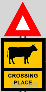
WARNING OF AN ANIMAL CROSSING PLACE