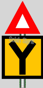
WARNING OF ROAD JUNCTION AHEAD