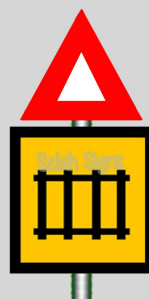
WARNING OF A PHYSICAL BARRIER AHEAD