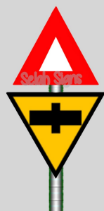
WARNING OF A STOP OR GIVE WAY SIGN AHEAD