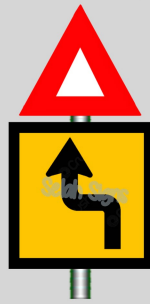
WARNING OF DOUBLE CURVE AHEAD