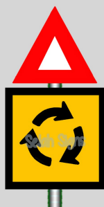
WARNING OF A TRAFFIC ROUNDABOUT AHEAD