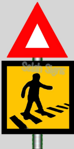
WARNING OF PEDESTRIAN CROSSING AHEAD