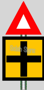
WARNING OF CROSS ROADS AHEAD