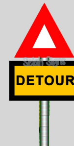
WARNING THAT TRAFFIC MUST SLOW DOWN TO FOLLOW A DETOUR