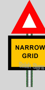
WARNING OF NARROW GRID AHEAD