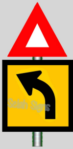
WARNING OF CURVE AHEAD