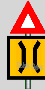
WARNING OF NARROW BRIDGE AHEAD