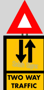
WARNING OF TWO WAY TRAFFIC AHEAD