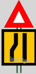
WARNING THAT ROAD NARROWS TO THE RIGHT AHEAD