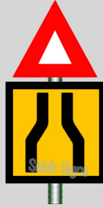
WARNING THAT ROAD NARROWS CENTRALLY AHEAD