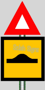
WARNING OF "HUMP" IN ROAD